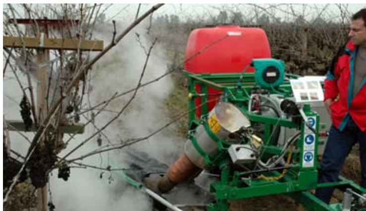
A weed steamer eradicates weeds without pesticides, tillage or damage to irrigation lines.

The Environmental Quality Incentives Program (EQIP) of the United States Department of Agriculture Natural Resources Conservation Service (NRCS) offers cost-share payments to growers for adoption of practices that can mitigate air quality impairment. The following tables indicate costs that the EQIP program will cover for growers who apply and qualify for this payment. SWP workbook criteria and practices have been matched to corresponding NRCS standards and practices for the EQIP program. Individual growers can generate reports in the SWP online system that specify relevant NRCS practices and associated EQIP cost-share opportunities and information. Growers can use the report to simplify and streamline the application and conservation planning processes (contact info@sustainablewinegrowing.org for more information). Additional programs which provide California winegrowers with cost-share incentives for improving technology or practices to reduce air emissions include the Carl Moyer Program and the Agricultural Diesel Conversion Incentive Program (see resources and SWP workbook page 16-16).