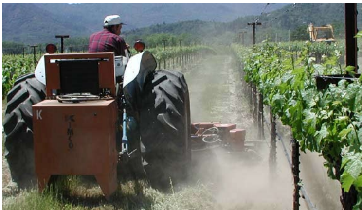
Minimizing tractor passes reduces particulate matter, ozone precursors, and greenhouse gases.